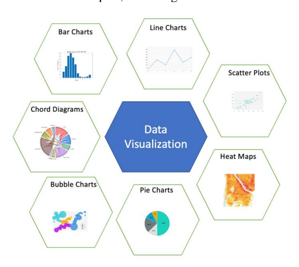
Fig. 2 Data Visualization Techniques

Data visualization techniques [27] are used to represent data in a graphical or pictorial form, making it easier to understand and interpret. There are several types [9] of data visualization techniques, including: